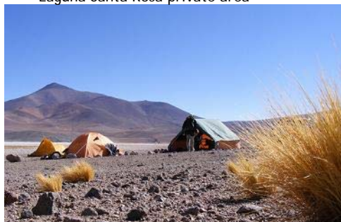
Laguna Santa Rosa private area